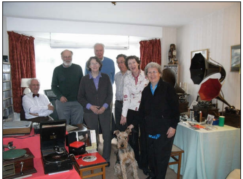
The Sound Recording Group