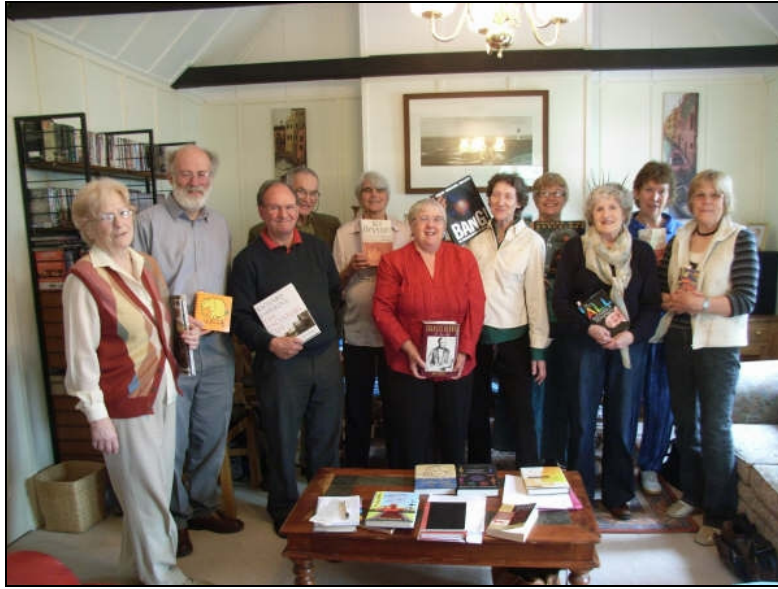
The Science Book Discussion Group